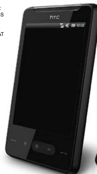
BELL DE JOUR: OUR PROGRESS IN MOBILE TELEPHONY IS NO SMALL FEAT

Then "Money never sleeps," says Gekko, coining a phrase (and a sequel title) as he calls Bud from his beach retreat. Only people like Gekko had mobiles in 1985. They were about the size of a loaf of bread. Now HTC has launched a tiny smartphone that doubles as a portable laptop modem. Google is developing a mobile that will translate 52 foreign languages in real time.