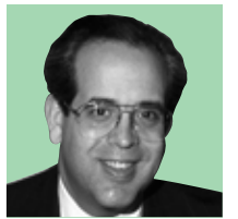
5 | Dennis Levine

“The Junk Bond King”, viewed by critics as the epitome of Eighties Wall Street greed, has an estimated net worth of $2.1bn. In 1990, he pleaded guilty to six securities and reporting felonies, but he is also a noted philanthropist with a huge influence on medical research.