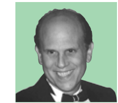
4 | Michael Milken