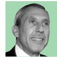
1 | Ivan Boesky

“Gordon Gekko was written in the spirit of fun and craziness — with the boring bits taken out,” says Oliver Stone. Gekko is an extreme, hyper-real figure, inspired by many Wall Street players, including these notable characters.