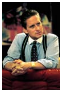
CONTRAST COLLAR, BRACES: EIGHTIES BRASH AT ITS BEST

Wall St In Numbers $20,000 Amount invested on the market by both Charlie Sheen and Shia LaBeouf in order to get into character.