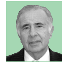
2 | Carl Icahn

The arbitrageur (one who attempts to profit from price inefficiencies in the market) who inspired Gekko's “greed is good” speech when he said, “Greed is alright... I think greed is healthy.” He was busted for insider trading as Wall Street was being written.