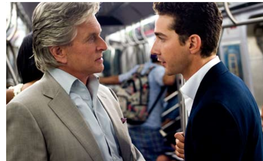
THE OLDER, POST-PRISON GEKKO OPTS FOR EXPENSIVE BUT INCONSPICUOUS

The Wisdom Of Gordon Gekko “What’s worth doing is worth doing for money”