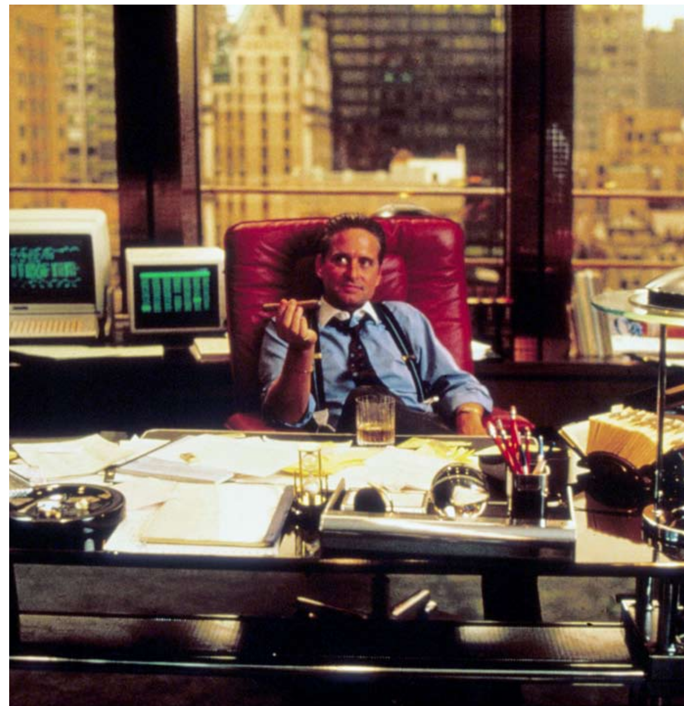
"IT'S NOT ALWAYS THE MOST POPULAR PERSON WHO GETS THE JOB DONE": CIGARS, SCOTCH, STOCKS AND SCORCHING ONE LINERS ARE ALL IN A DAY'S WORK FOR MICHAEL DOUGLAS AS GEKKO, IN 1987'S WALL STREET

MD Oh, yeah. Sure. I played. Years ago, through the tech booms, I definitely did it. In terms of venture capitals, until the Nineties, when that got all whacked. I lost 35 to 40 per cent of my net worth on the '08 crash. Didn't do anything; just watched it go →