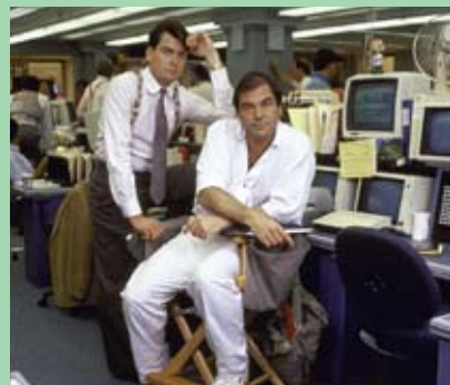
CHARLIE SHEEN AND OLIVER STONE ON SET

me and said, ‘I went to Wall Street because of that movie,’” says Stone of fans who care little for the end of the film, where morality comes into play. Michael Douglas has had drunken stockbrokers say the same to him: “Remember, I was the villain,” he tells them. They don't care. Gordon Gekko, it seems, was more powerful than his own movie.