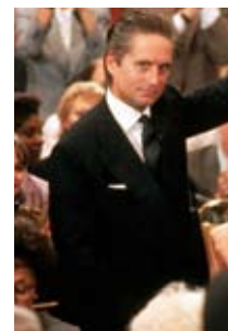
THE SLICKBACK: STILL A STOCKMARKET STAPLE, FOR MEN OVER 40